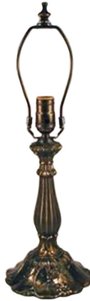
Lily 266 mm Code: LB9035