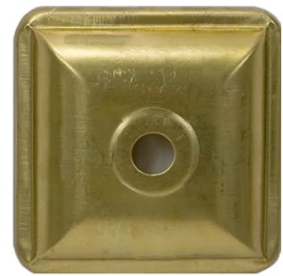
38mm 4 Sided Vase Cap Code: LA81850 70mm 4 Sided Vase Cap Code: LA81855