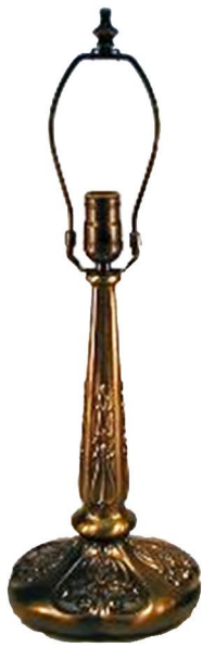
Flower 323 mm Code: LB9090