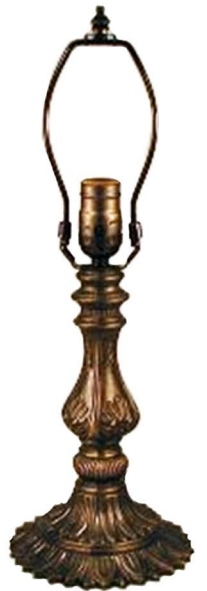
Shell 241 mm Code: LB9026