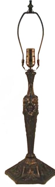
Lionhead 381 mm Code: LB9042