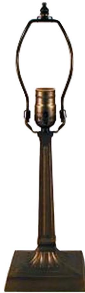
Mission 241 mm Code: LB9214