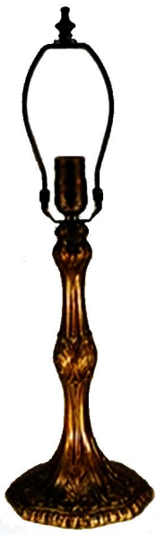
Pompeii 320 mm Code: LB9063