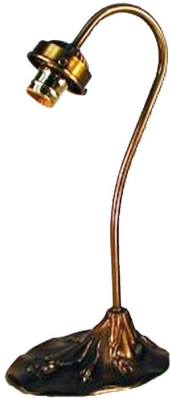
Lily Goose Neck 381 mm Code: LB9400