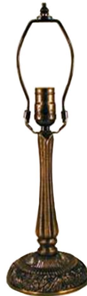
Sentry 241 mm Code: LB9061