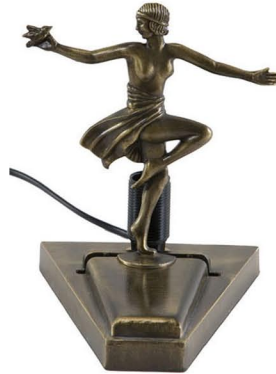
Woman and Bird Code: LB88011