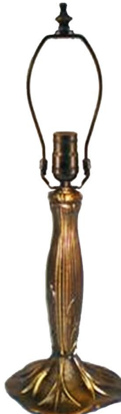
Lily Pad 292 mm Code: LB9022