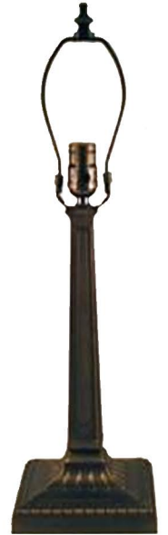
Mission 350 mm Code: LB9082