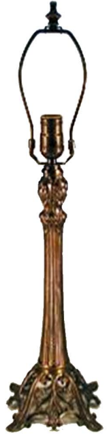
Lynx 381 mm Code: LB9347