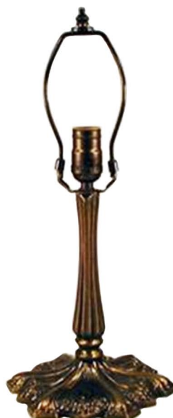
Fluted 229 mm Code: LB9056