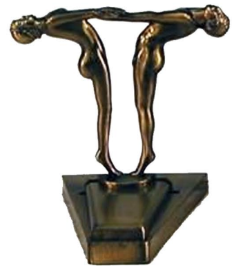
Two Dancers Code: LB88013