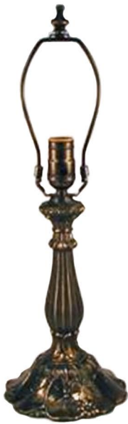
Lily 241 mm Code: LB9021