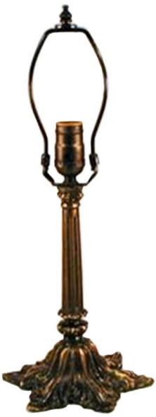
Column 241 mm Code: LB9045