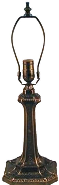
Gothic 273 mm Code: LB9020