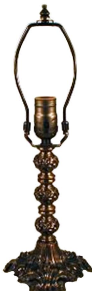
Swirl 203 mm Code: LB9072