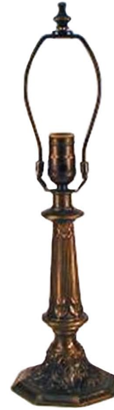
Scroll 266 mm Code: LB9019