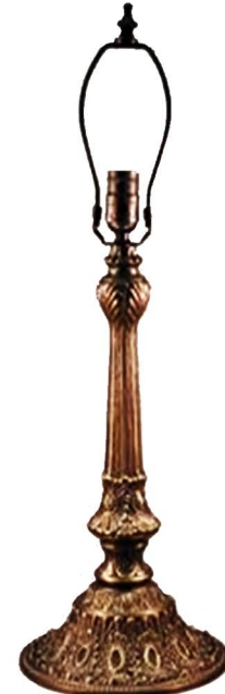
Acorn 406 mm Code: LB9043