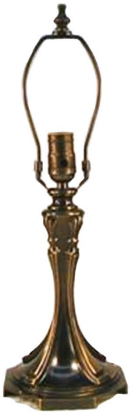
Abbot 254 mm Code: LB9257