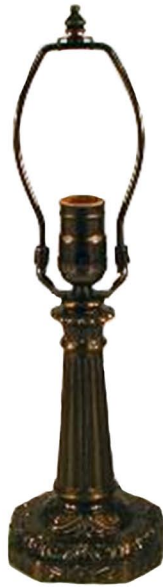
Phoenician 254 mm Code: LB9012