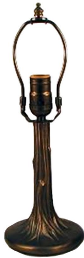
Tree 190 mm Code: LB9014