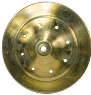
Brass Vase Caps

Spun brass unfinished, not lacquered, diamond vented caps.