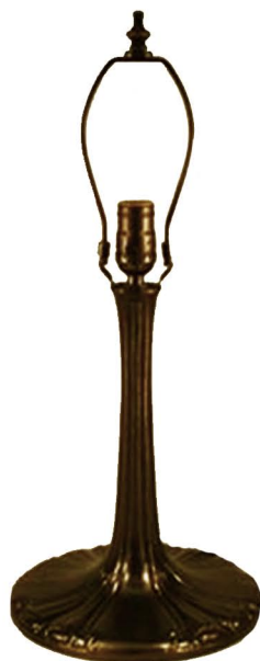
Jewel 279 mm Code: LB9078