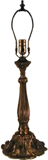
Lily 241320387 mm Code: LB9036