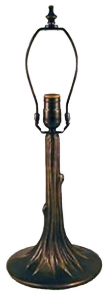
Tree 266 mm Code: LB9015