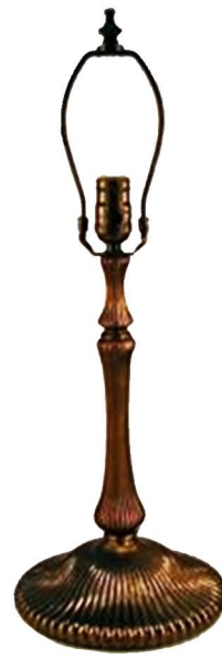
Nova 343 mm Code: LB9267