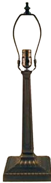
Mission 323 mm Code: LB9210