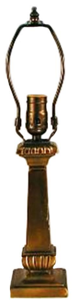
Mateo 234 mm Code: LB9343