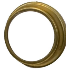
Brass Ring Used to connect shade to Goose Neck Lamp Bases Code: LA8050