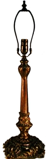
Irene 394 mm Code: LB9353