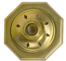
6 Sided Brass Vase Cap Code: LA81860V 40mm approx 8 Sided Brass Vase Cap Code: LA81861V