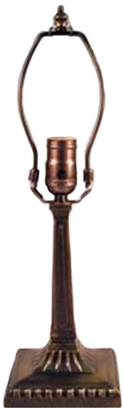
Mission 203 mm Code: LB9098