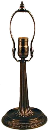
Classic 184 mm Code: LB9027

Please note stock varies in store and lamp bases may need to be ordered.