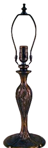
Nile 305 mm Code: LB9063