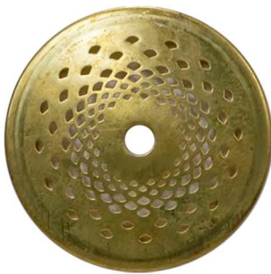
Vented Brass Vase Caps

Vented Caps to let the heat out. Unfinished, not Lacquered.