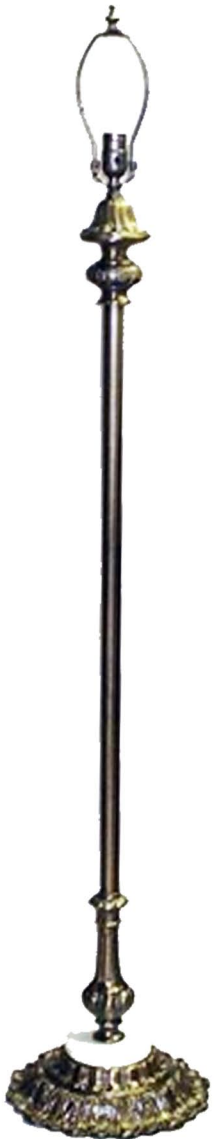
Pillar Base with Onyx 1295 mm Code: LB9502 By order only