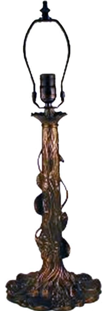
Vine 431 mm Code: LB9030