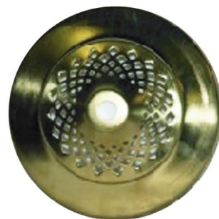
Vented Brass Fancy Caps

Because of their intricate design, these caps look great on lamp base shades.