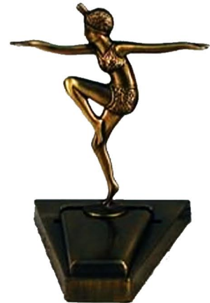
Flapper Code: LB88010