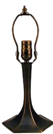
Clari 197 mm Code: LB9071