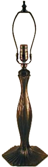
Parisian 355 mm Code: LB9010