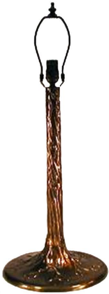
Tree 508 mm Code: LB9017