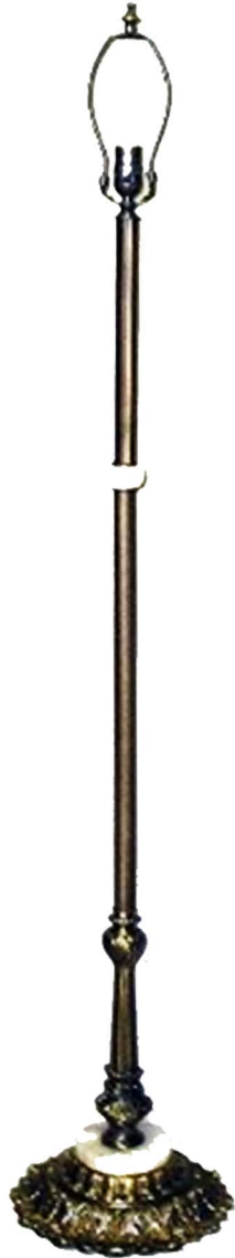
Acorn Base with Onyx 1345 mm Code: LB9053 By order only