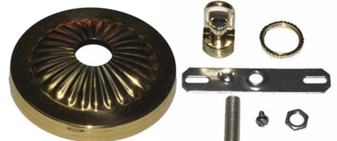
Canopy Hanger Kit Code: LA8080 Canopy Hanger Kit Black Code: LA8094 Canopy Hanger Kit Brass Code: LA8080