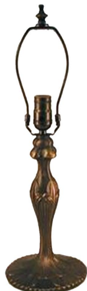
Nouveau 279 mm Code: LB9006