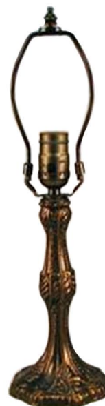
Pompeii 229 mm Code: LB9002