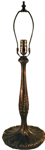
Jason 394 mm Code: LB9067