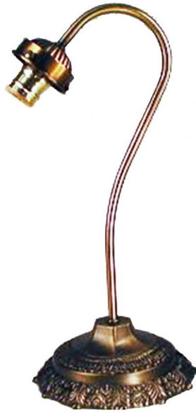
Classic Goose Neck 394 mm Code: LB9540