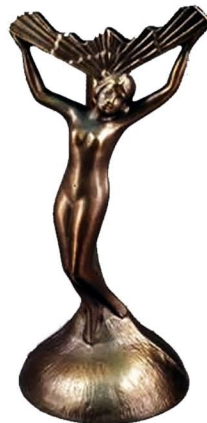
Art Deco Code: LB88004