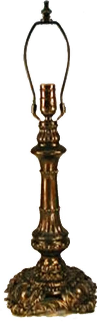
Jupiter 356 mm Code: LB9354