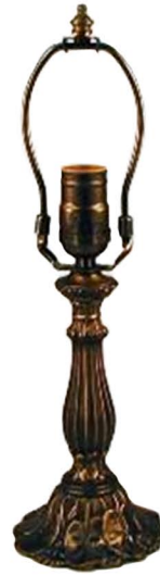
Lily 197 mm Code: LB9034