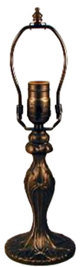
Nouveau 197 mm Code: LB9005